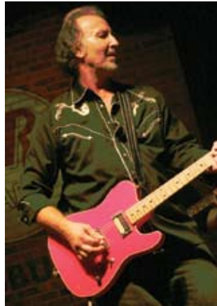
JOE GRUSHECKY & THE HOUSEROCKERS