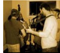
THE OLD HATS