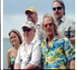
KEY WEST EXPRESS