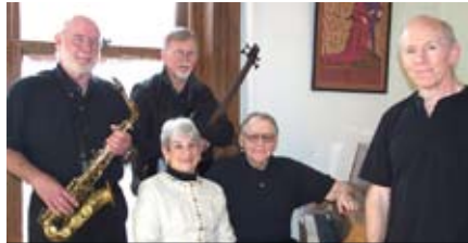
THE B & E COMBO