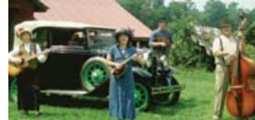
ALLEGHENY STRING BAND