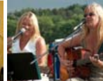
THE RYVER NYMPHS