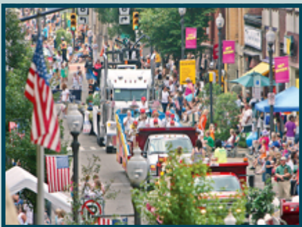
Crowds gather for the largest parade in Venango County