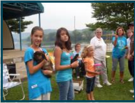
Children's Pet Show Winners