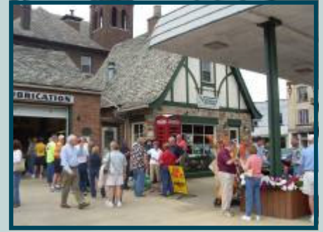
Short Street Motor Cars Reunion