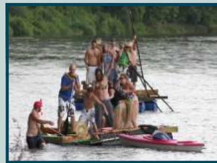
Rafters racing towards the finish line