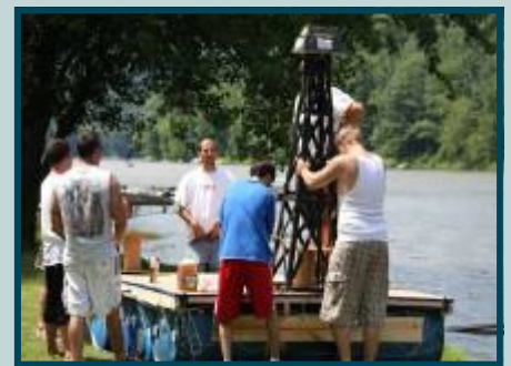
This raft won most spectacular by shooting fireworks out of the derrick