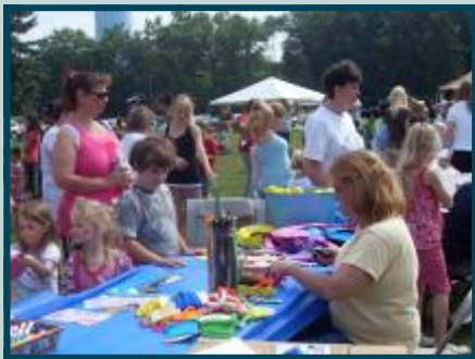
Teddy Bear Picnic Activities