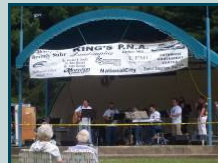
Praise in the Park offers a Sunday Service