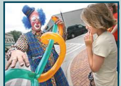
Clowns make beautiful balloon art