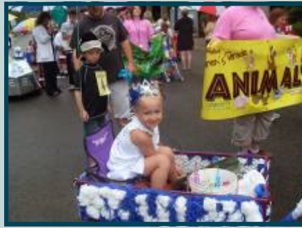
Children's Parade Winner