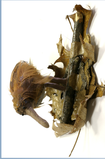
"The Common Snipe"

Friday through Sunday May 1, 2 & 3, 2009