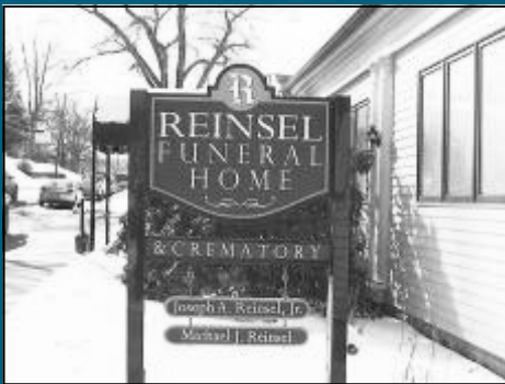
New signage at the Reinsel Funeral Home & Crematory